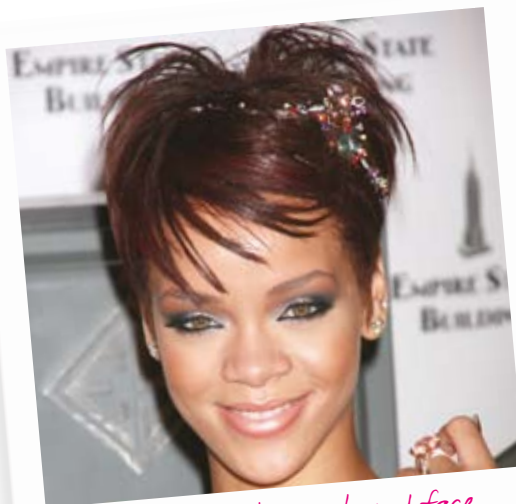
Rihanna has a heart-shaped face, so her side-swept fringe suits her face shape.

The maximum commercially viable service time for cutting hair is 45 minutes.