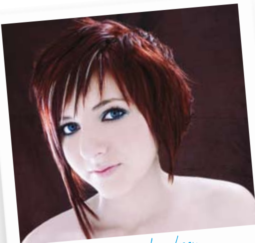
This asymmetric cut has been personalised to suit facial features.