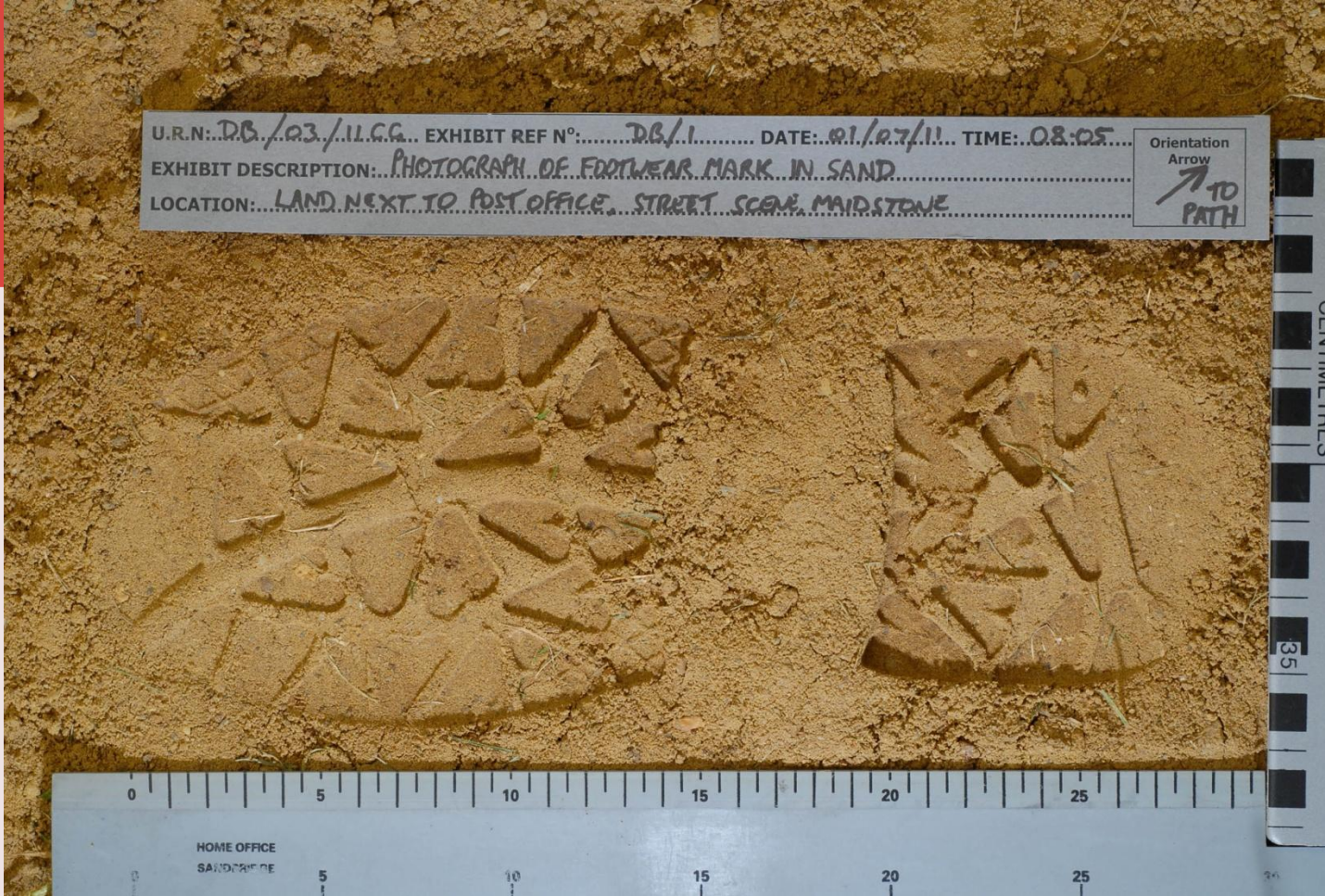
DB/1 – Photograph of footwear mark in sand