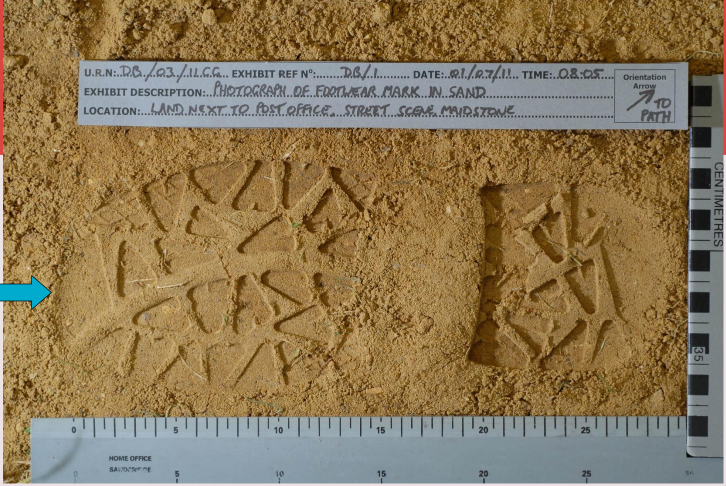
DB/1 – Photograph of footwear mark in sand