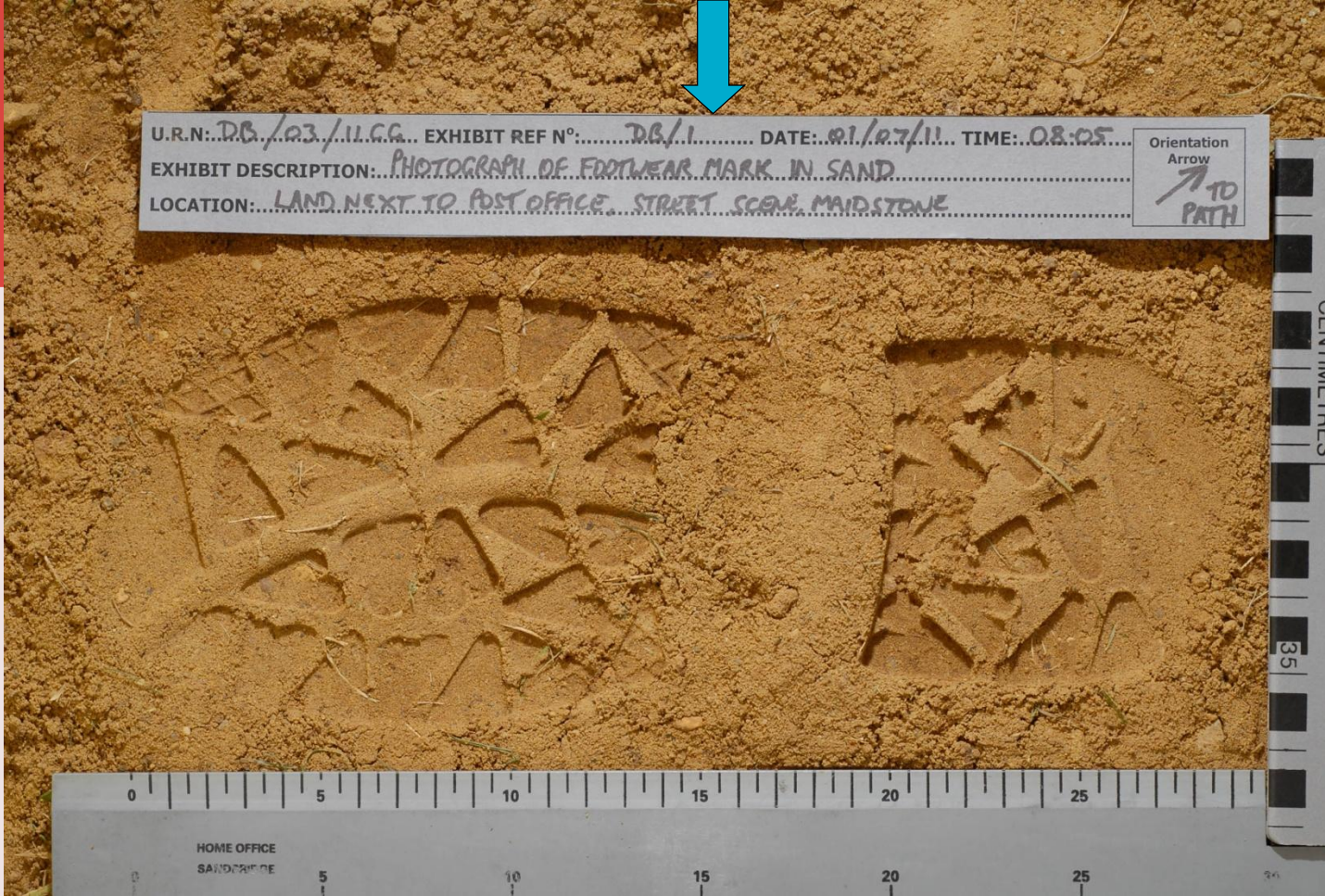
DB/1 – Photograph of footwear mark in sand